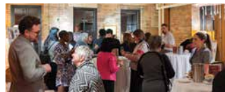
Appetizers, wine, and Meaningful Conversation, with the panelists of the evening. A chance to pick-up some wonderful resources on staying connected to community or to nature!