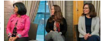
Stay tuned for more presentations organized by Mosaic Home Care.